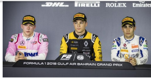
Max at the FIA Top 3 press conference in Bahrain. All pictures copyright: FIA Formula 2 Media Services